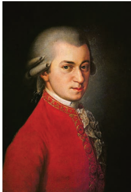
Figure 5.5 | Wolfgang Amadeus Mozart

Mozart's father was quite proud of his children, both being child prodigies. At age seven, Wolfgang, his father, and his sister Maria Anna (nicknamed "Nannerl") embarked on a tour featuring Wolfgang in London, Munich, and Paris. As was customary at the time, Wolfgang, the son, was promoted and pushed ahead with his musical career by his father. While his sister, the female, grew up traditionally, married, and eventually took care of her father Leopold in his later years. However, while the two siblings were still performing, these tours occurred from when Wolfgang was between the ages of six and seventeen. The tours, though, were quite demeaning for the young musical genius in that he was often looked upon as just a superficial genre of entertainment rather than being respected as a musical prodigy. He would often be asked to identify the tonality of a piece while listening to it or asked to sight read and perform with a cloth over his hands while at the piano. Still, the tours allowed young Mozart to accumulate knowledge about musical styles across Europe. As a composer prior to his teens, the young Mozart had already composed religious works, symphonies, solo sonatas, an opera buffa, and Bastien and Bastienne , an operetta; in short, he had quickly mastered all the forms of music.