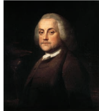
Figure 5.1 | Benjamin Franklin, 1759

Artists and architects of the second half of the eighteenth century looked to classical antiquity as its model; their work is referred to as neoclassical. You can see this interest when one compares the Parthenon in Athens to the columns of the White House. While in power, aristocrats and their wealthy peers exalted the Hellenism that protected them from getting too involved in the current issues of life. The aristocrats saw the ancient Roman gods, heroes, and kings as semblances of themselves. They viewed themselves in the same light as super humans entitled to rule, possess great wealth, and be powerful. This detachment shaped their relationship with the arts in architecture and the visual arts. The rising middle class, on the contrary, viewed and interpreted neoclassical arts as representations of Roman and Greek city-states. This view assisted their resolve to rebel against the tyrants and abolish despotism. Here musical terminology diverges from that used by art historians (Neoclassicism in music would have to wait for the 20 th century). As we have few musical exemplars from classical antiquity and as the music of Haydn, Mozart, and Beethoven would become the model for nineteenth century music, music historians have referred to this period as a time of Musical Classicism.