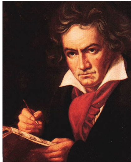
Figure 5.6 | Ludwig van Beethoven

Beethoven had a complex personality. Although he read the most profound philosophers of his day and was compelled by lofty philosophical ideals, his own writing