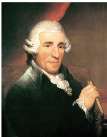
Figure 5.4 | Joseph Haydn, 1791

Born in 1732, Joseph Haydn grew up in a small village that was located about a six-hour coach ride east of Vienna (today the two are about an hour apart by car). His family loved to sing together, and perceiving that their son had musical talent, apprenticed six-year-old Joseph Haydn to a relative who was a schoolmaster and choirmaster. As an apprentice, Haydn learned harpsichord and violin and sang in the church. So distinct was Haydn's voice that he was recommended to Vienna's St.