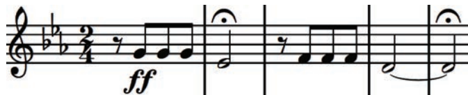
Figure 5.8 | Opening of Symphony No. 5, Op. 67

After a transition, the second theme is heard. It also starts with the SSSL motive, although the pitches heard are quite different. The horn presents the question phrase of the second theme;